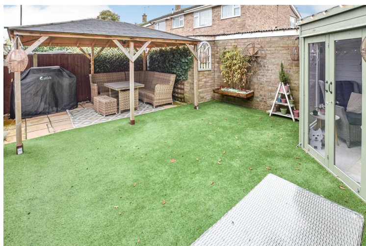
Rear Garden 28'0 x 19'5 (8.53m x 5.92m)

Upvc double window to rear aspect, carpet, covered artex ceiling, fitted wardrobes with sliding doors, radiator, TV and power points.