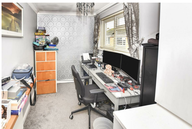
Bedroom Three 11'11 x 6'5 (3.63m x 1.96m)

Low maintenance landscaped rear garden, with a patio covered by timber built gazebo, astro turf area and summer house with power supply. spacious side access and gate to front of property.